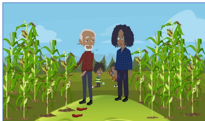
Example images from the Learning Modules, presentation slide (left) and training video (right).