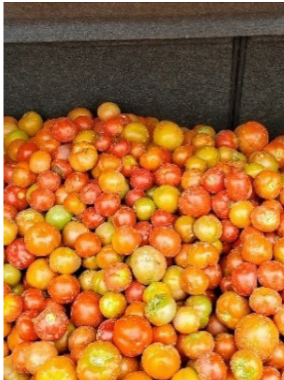
Some of the crops Ruth grows on her farm.