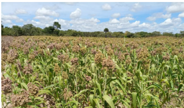
Seed increase unit for one of the released varieties