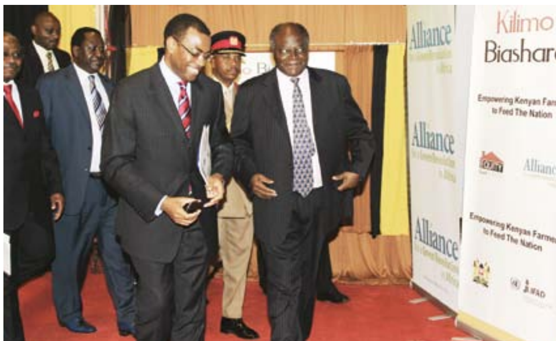
Kenya’s President, H. E. Mwai Kibaki launches the AGRA/IFAD/Government of Kenya/Equity Bank Innovative Financing ‘Kilimo Biashara’ program. From left: IFAD Vice-President, Kanayo Nwanze (partially shown); next to him Prime Minister of Kenya, Hon. Raila Odinga; and in the foreground AGRA Vice President, Dr Akin Adesina and President of Kenya, H. E. Mwai Kibaki.

AGRA’s vision, mission, goals and objectives rest on the principles embraced when the Alliance first came into being – that African agricultural problems require African solutions, and that the