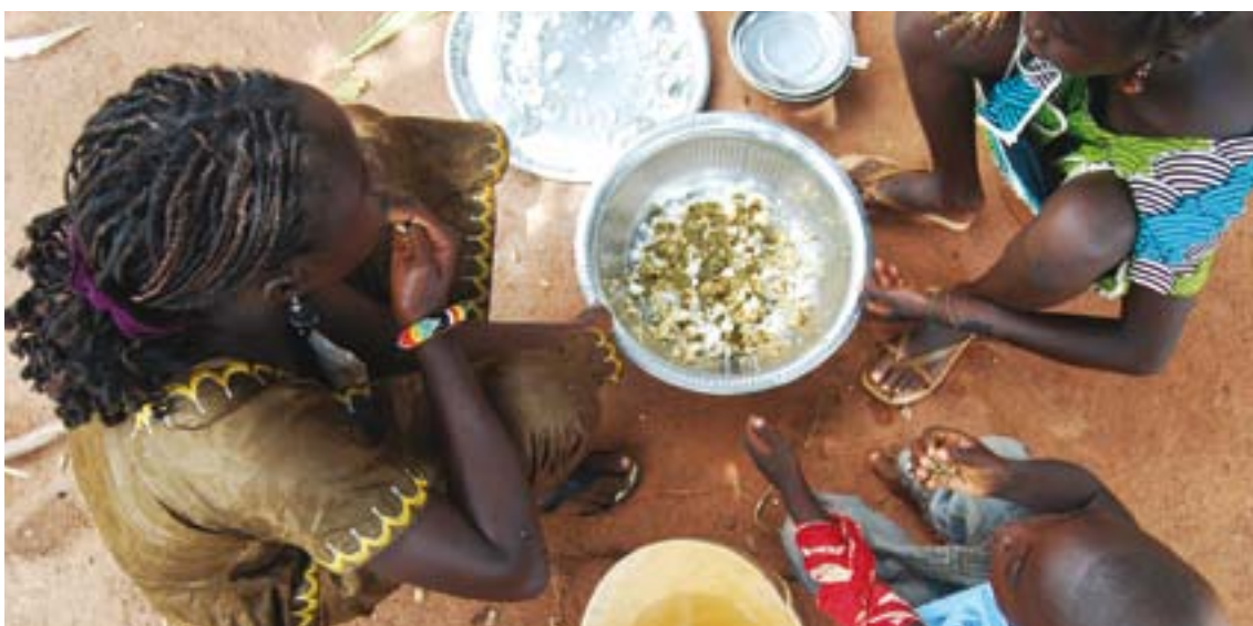
Children in a village in Bamako, Mali sharing a meal. Many African farm households purchase food to supplement what they grow for themselves. As a result, surging food prices have had a negative effect on the diets of the poor across Africa.

Outdated policies that constrain advances in smallholder agricultural productivity across Africa have also conspired to raise the cost of food produced locally. Farmers face serious barriers to selling their produce in local and regional markets, and as a result they lack the incentives needed to