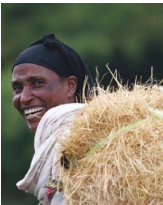
Crop by-products such as fodder for livestock are often transported by foot over long distances to local markets in order to augment household incomes. Government policies and investments that improve rural infrastructure and facilitate access to markets are essential for catalyzing Africa's Green Revolution.

Students earn a Master of Science in Agricultural and Applied Economics, through a Collaborative Masters Program. The graduates have begun to provide national and regional leadership in creating an enabling policy environment for Africa's Green Revolution.