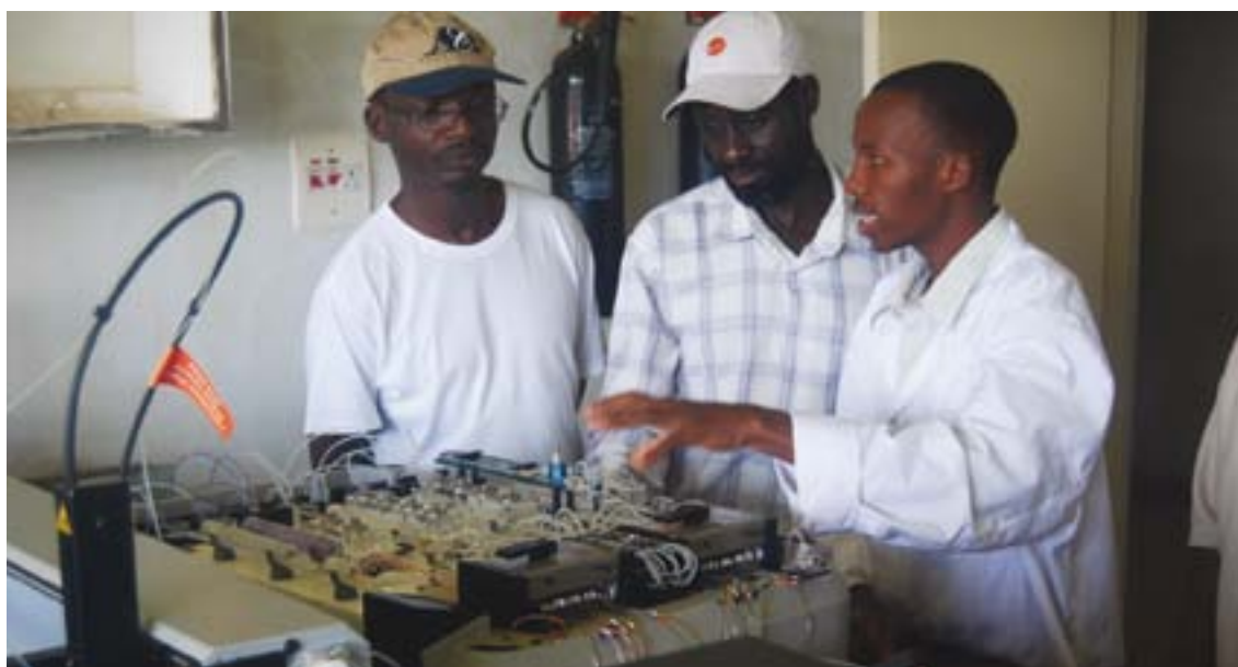
Soil technicians at the Kenya Agricultural Research Institute (KARI) evaluate the acidity and other properties of soil samples from western Kenya in order to develop appropriate soil treatment recommendations, such as liming, that will improve farm productivity and raise household incomes.

Market Access – Working together, PASS and SHP can do much to increase the productivity and production of smallholder farmers. But without better ways to market the anticipated