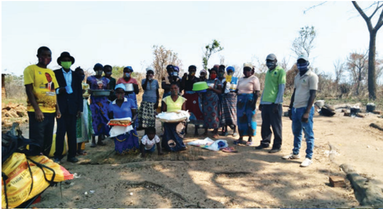
Replica of the nutrition training in the community.