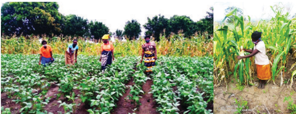
The fields of the women involved in the production of Soybean and Gema Maize.