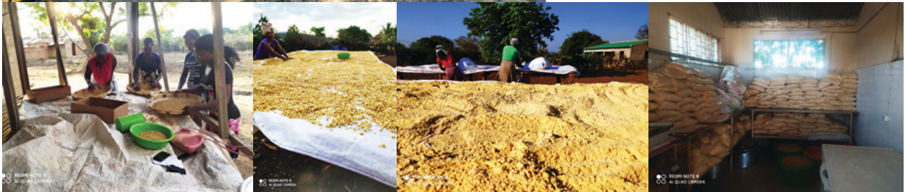
Different phases of the Gema Maize Flour fortification process with Soybean.